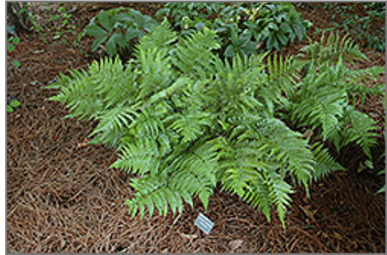
Autumn Fern

Autumn Fern will grow to be about 18 inches tall at maturity, with a spread of 18 inches. Its foliage tends to remain dense right to the ground, not requiring facer plants in front. It grows at a medium rate, and under ideal conditions can be expected to live for approximately 15 years. As an evergreen perennial, this plant will typically keep its form and foliage year-round.