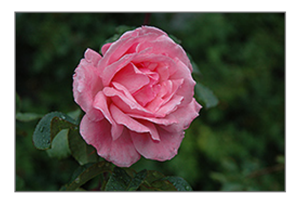
Queen Elizabeth Rose flowers

This is a high maintenance shrub that will require regular care and upkeep, and is best pruned in late winter once the threat of extreme cold has passed. Gardeners should be aware of the following characteristic(s) that may warrant special consideration;