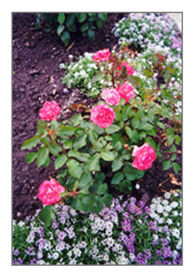
Queen Elizabeth Rose in bloom