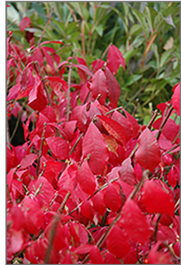
Burning Bush (tree form) in fall