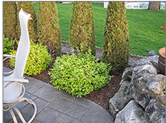
Country Gold Wintercreeper