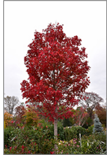
October Glory Red Maple in fall