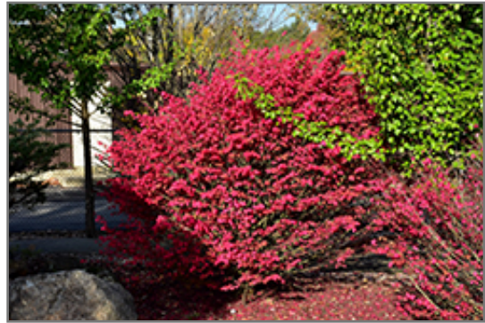
Little Moses Burning Bush in fall