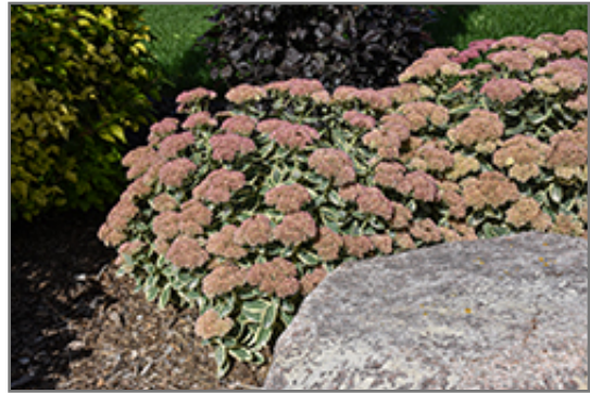
Autumn Charm Stonecrop in bloom