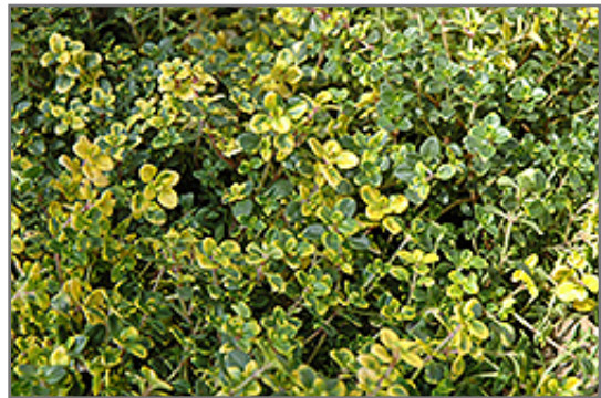
Doone Valley Thyme