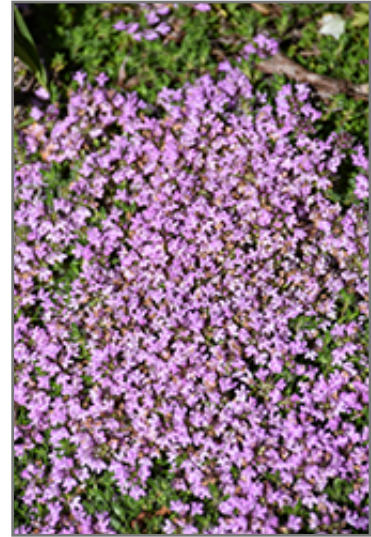
Elfin Creeping Thyme flowers