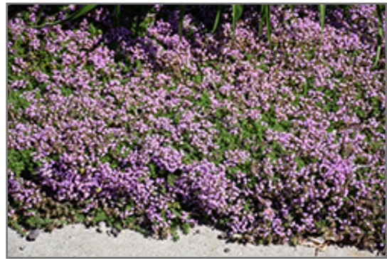
Elfin Creeping Thyme in bloom