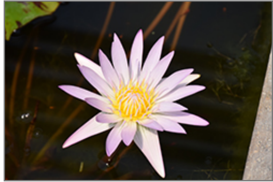
Madame Ganna Walska Tropical Water Lily flowers